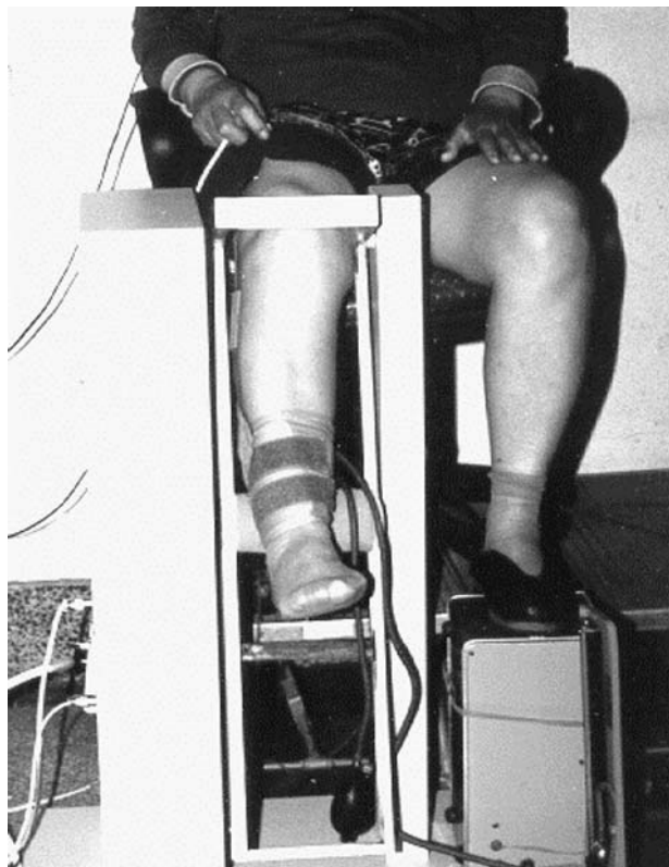
Figure 2 Customised apparatus used to test passive motion sense of the knee joint.

freely over the edge of the seat 5 cm proximal to the popliteal fossa. A custom made inflatable cuff was fitted above the knee joint and inflated to 20 mm Hg to neutralise cutaneous sensation. The axis of rotation of the knee joint was aligned with the axis of rotation of the frame. Then the researcher placed the lower part of the shank of the subject on the frame. An ankle inflatable cuff was applied and inflated to 20 mm Hg to reduce multisensory afferent discharge at the shank-machine interface. To further reduce unwanted sensory input, the subjects kept their eyes closed and wore headphones with music playing to eliminate the sight and sound of the apparatus.